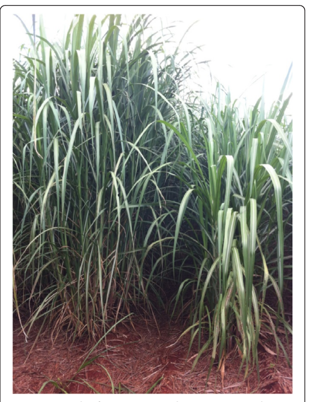
Figure 1 Example of energy cane and sugarcane at 90 days after planting. Left: F1 of S. officinarum × S. spontaneum ; Right: commercial hybrid of sugarcane.

development of lignocellulosic ethanol conversion technologies. In the USA, the development of energy canes with increased overwintering ability could result in a crop that has a far wider range of adaptation than the crop that presently exists [65]. Aiming to evaluate the potential expansion of the seasonal operation of Louisiana sugar mills (currently operating for only 3 months every year because of the sugarcane availability) as well as to generate ethanol in these mills, Kim and Day [66] studied the utilization of two additional feedstocks: sweet sorghum and energy cane. Based on this work, it was assumed that 13 tons of ethanol could be produced from 1 ha of energy cane (considering a productivity of 100 tons/ha), more than twice than the estimated production for sweet