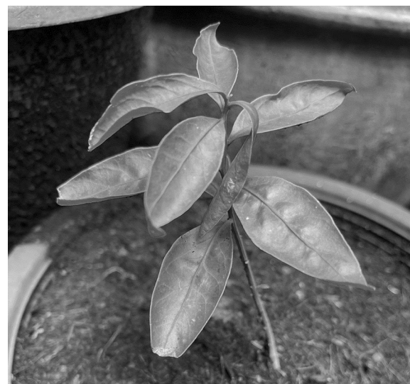
Fig. 1 Morphological illustration of M. suavis

The sun-dried leaves and twigs of M. suavis were crushed into powder (1.7 kg) and extracted with