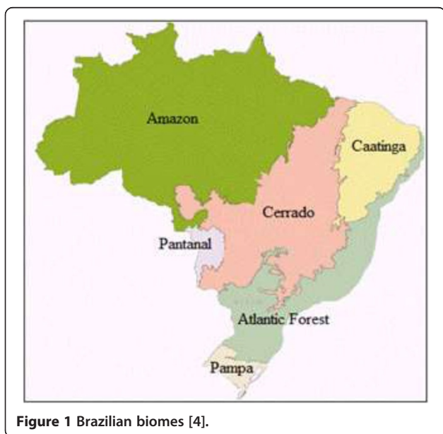
Figure 1 Brazilian biomes [4].

From the total area of Eucalyptus planted in Brazil, 5.5% is located in the North, 16.4% in the Northeast,