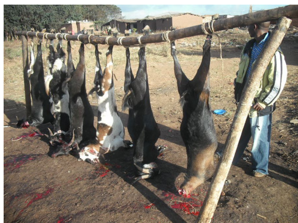
Fig. 2 Goats hoisted after slaughter at Chinsapo-2 in Lilongwe, Malawi

This simply means that meat handlers in Malawi are unhygienic when slaughtering goats and other animals (Figs. 2, 3). This also concurs with Adzitey et al. [3] who reported that possible sources of contamination in beef cattle in Tamale Metropolis in the Northern Region of Ghana may come from the cutting knives, intestinal contents, meat handlers and the meat selling environment. The high values of microorganisms after treatment on hands and knives at Chinsapo-2 could be attributed to the water they used which was from unprotected water sources or from contamination with the environment soon after treatment. Another reason could be poor level of hygiene on the part of the butchers since they normally use the same knives throughout the line of processing of the carcasses.