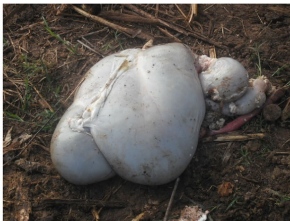
Fig. 3 Evisceration of goats on the ground at Chinsapo-2 and Chigwirizano